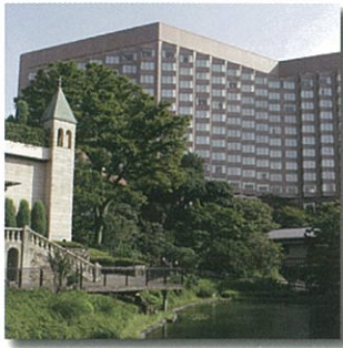
Hotel Chinzanso Tokyo