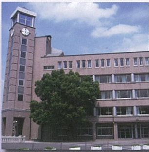
Gyosei School Campus