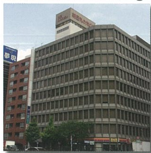
Asahi Marunouchi Bldg.