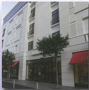
Yokohama Yamashita-cho Bldg.