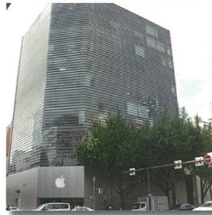
Urban Bldg., Shinsaibashi