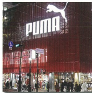
PUMA Store Shinsaibashi