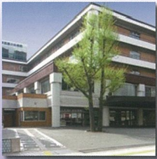
Nippon Medical School Musashikosugi Hospital