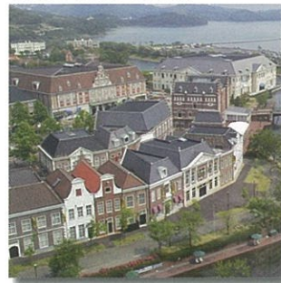
Huis Ten Bosch